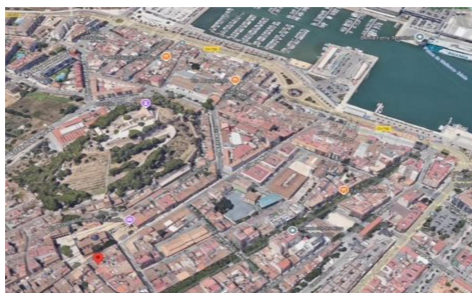
• PLANTA TERCERA